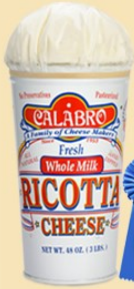
Hand Dipped Ricotta