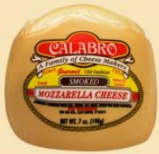
Gourmet Fior di Latte